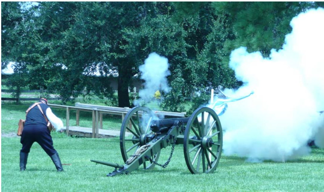
Colonel Speir demonstrating artillery safety.